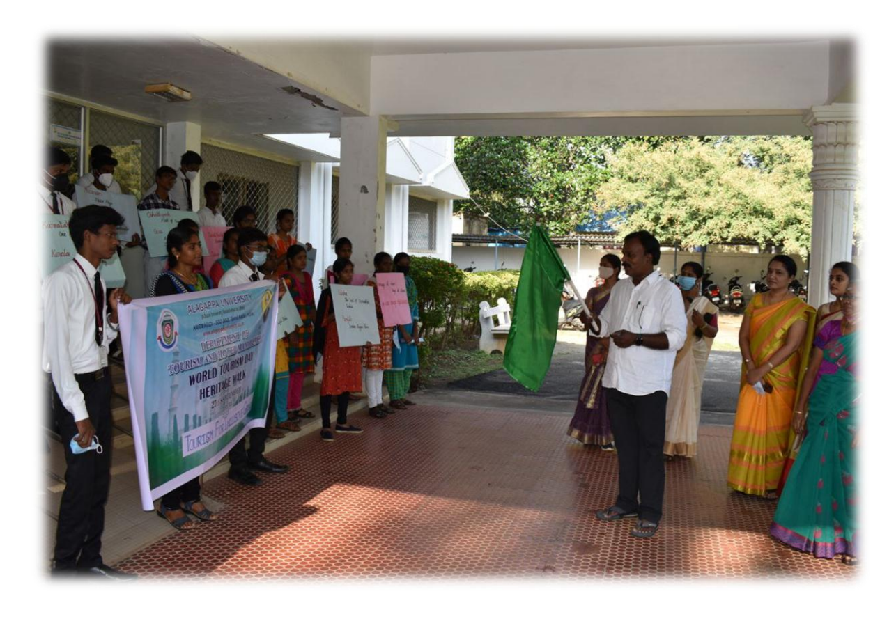
The Registrar i/c is flagging off to start the Heritage Walk