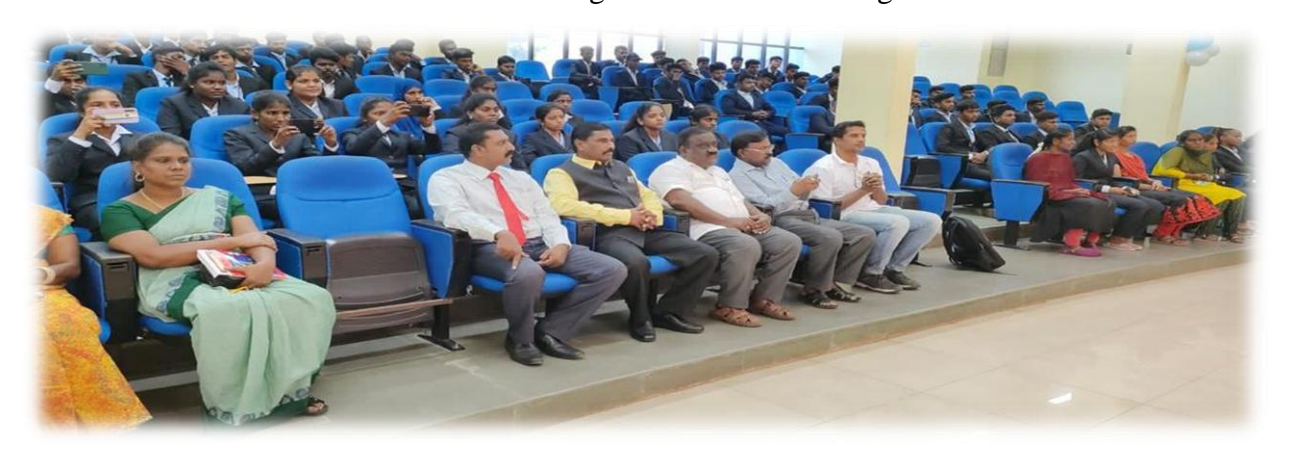
The participants in the World tourism day function