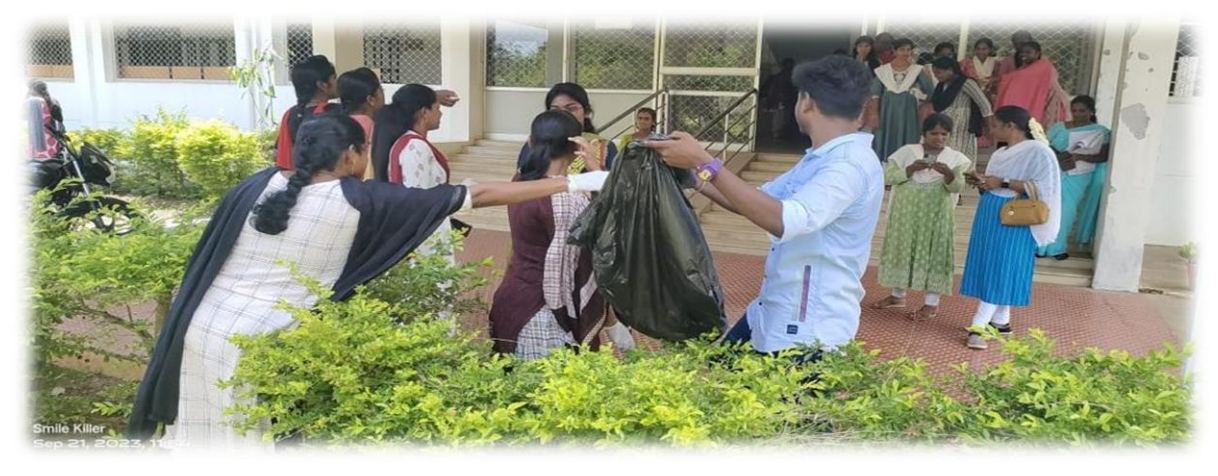
Our Department students are in cleaning activity