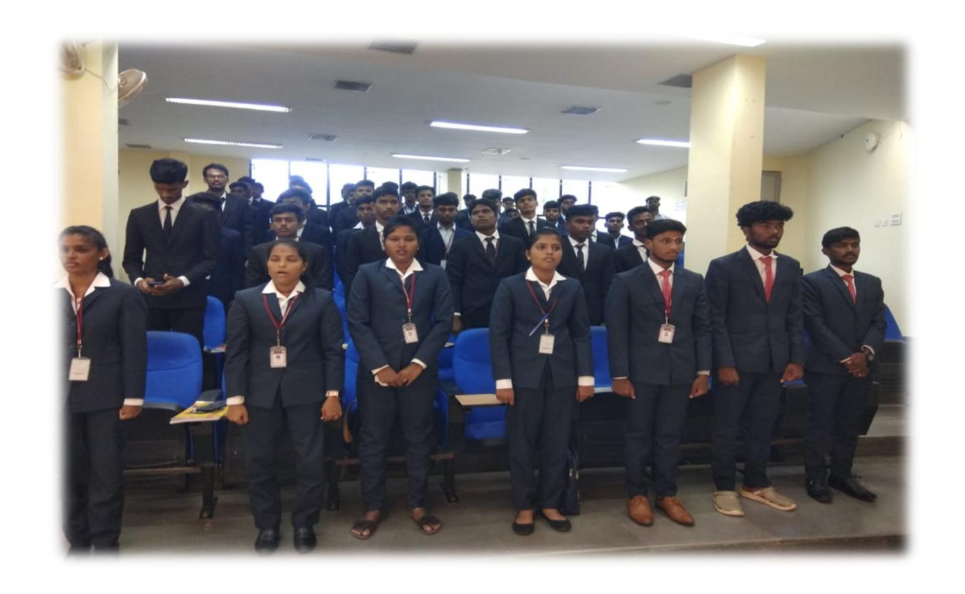
The participants in the International conference