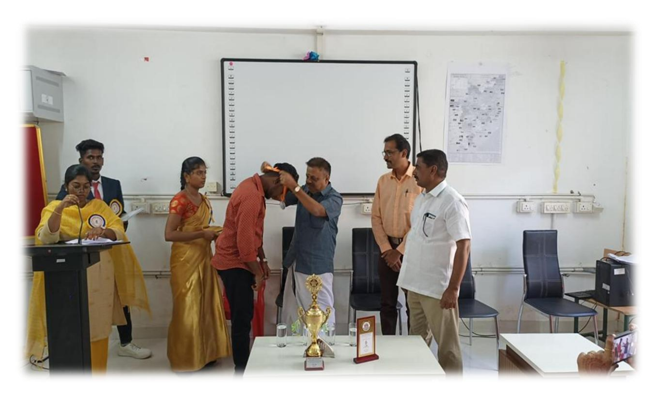
The Chief guest is honouring the winner with medal