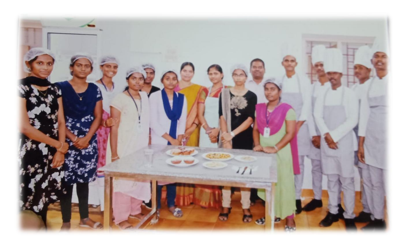
The participants of the workshop