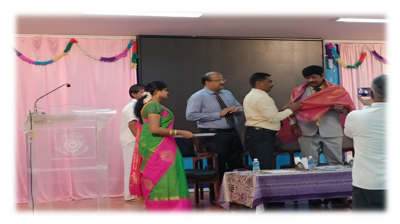
Our HOD honoured the Honourable Vice Chancellor