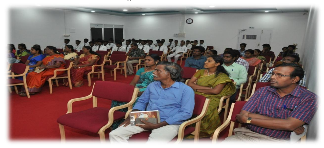
The Participants of Administrative Staff of Alagappa University