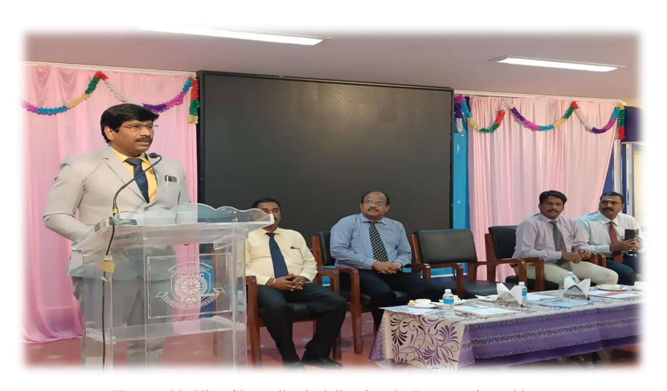
Honourable Vice Chancellor is delivering the Inauguration address