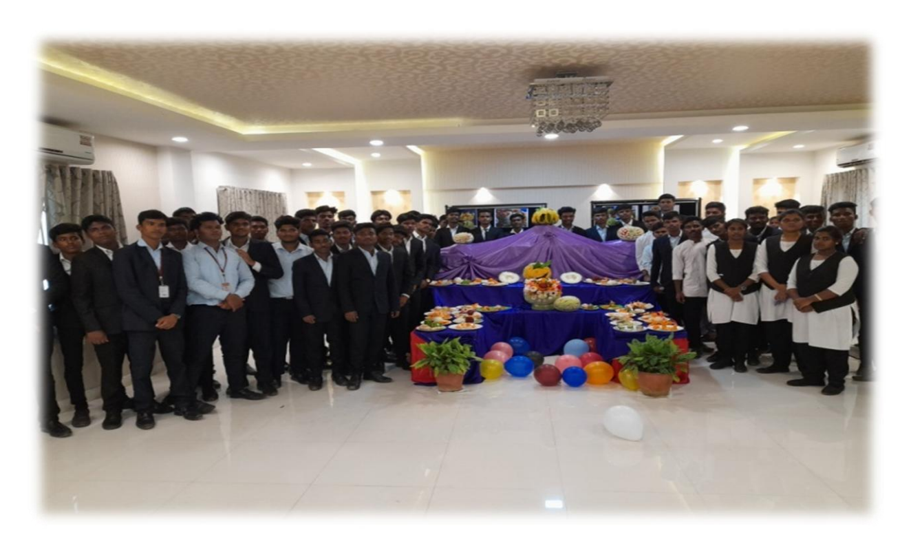
The participants of the workshop