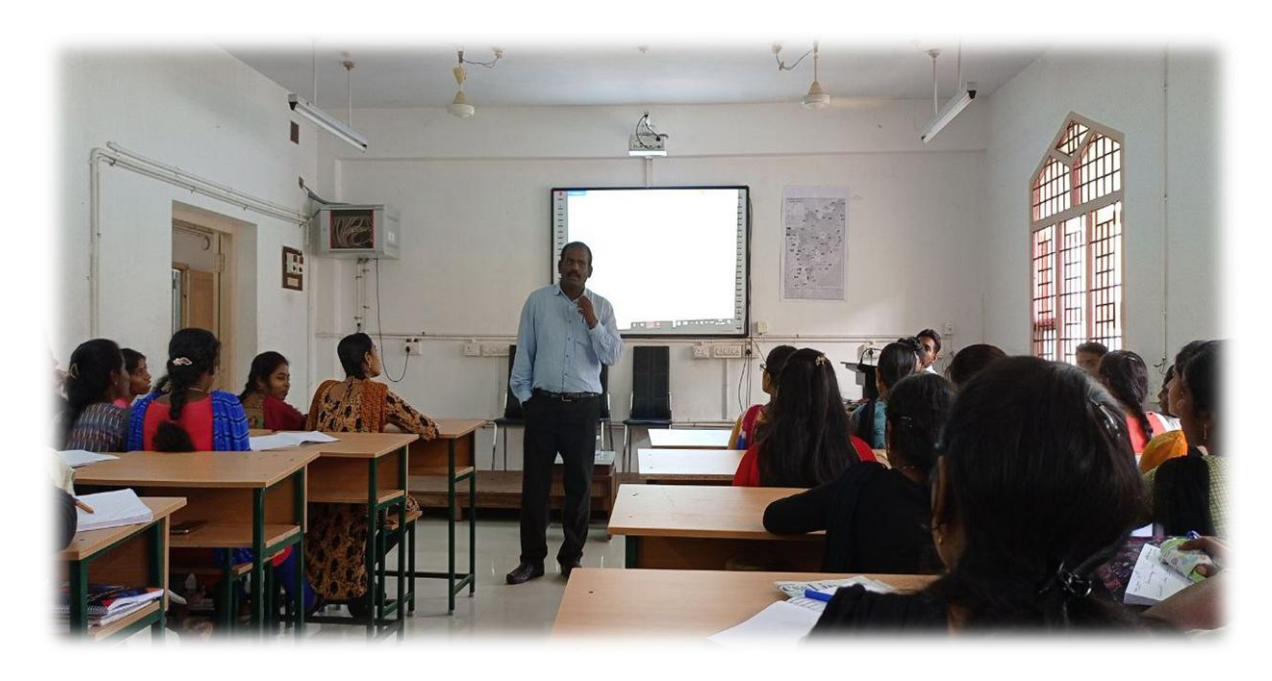
Question and Answer session