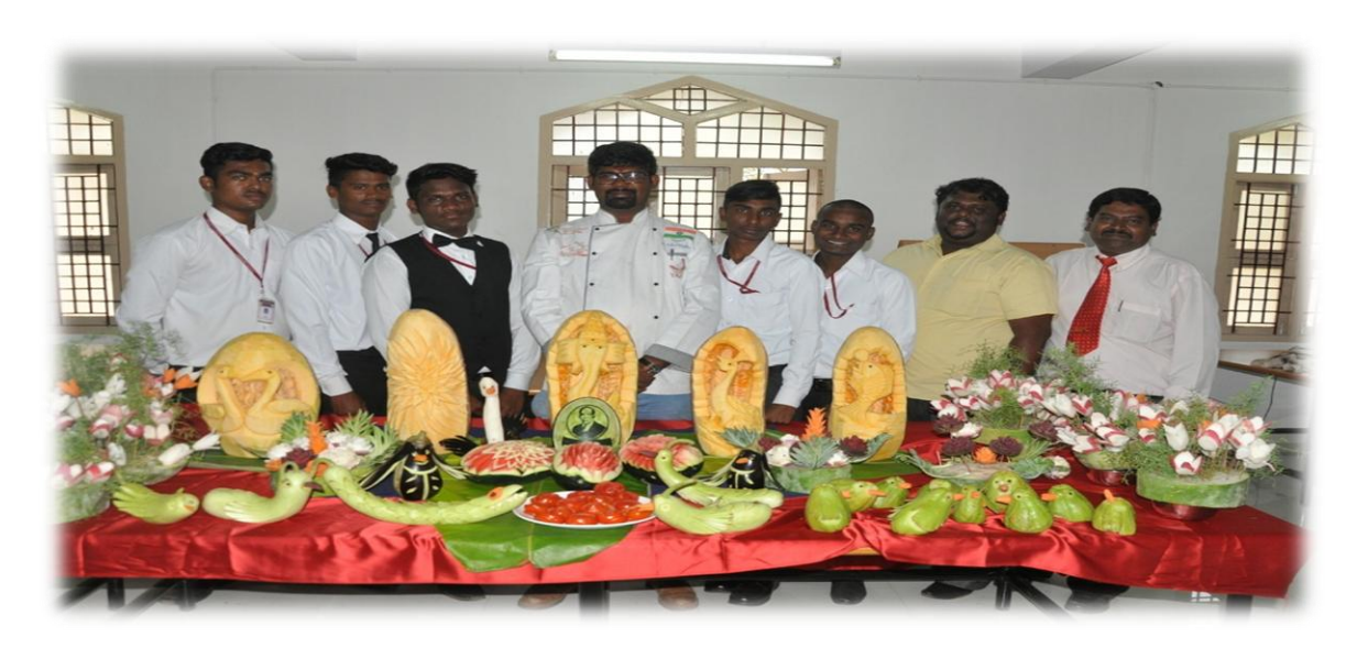
Carved vegetables were kept for display