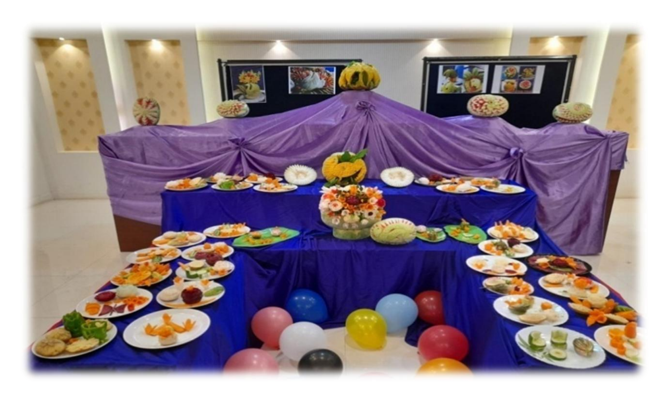
Vegetable art and sculptures were kept for display