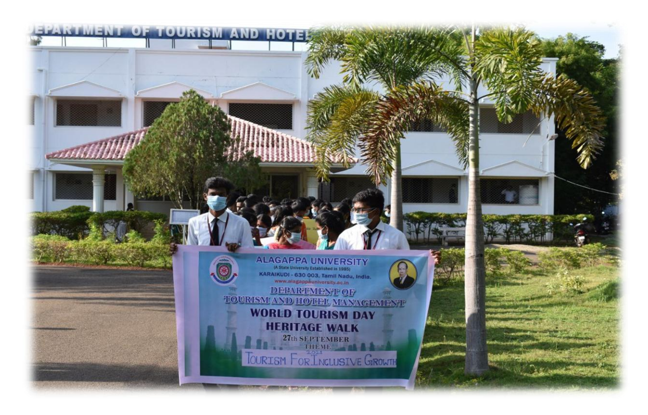
The Heritage walk is started from the Department of Tourism and Hotel Management