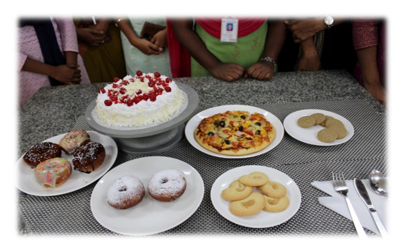
Students preparation kept for display