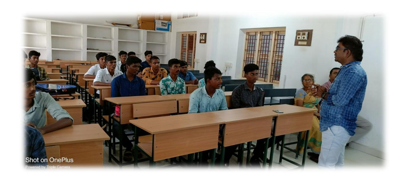
Question and Answer session