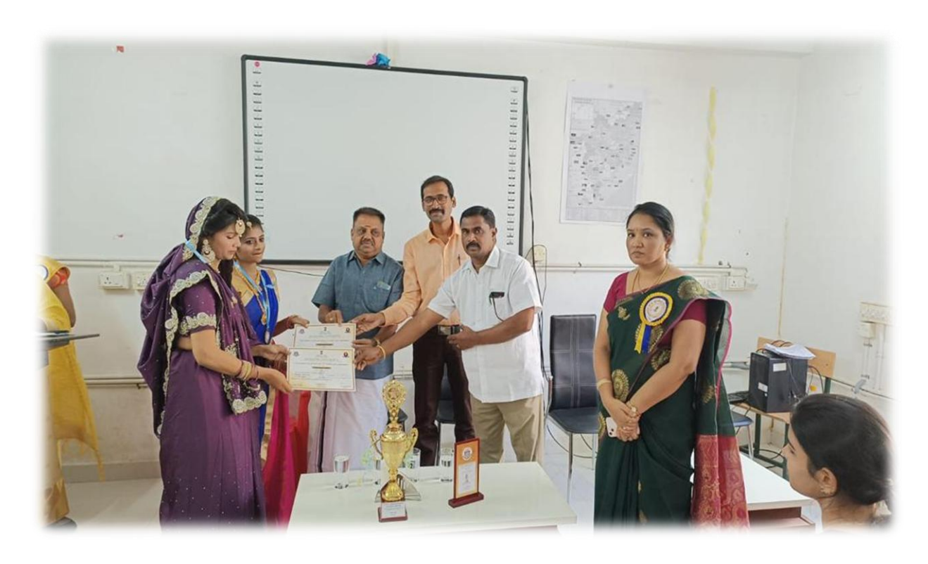
The Chief guests are distributing the certificates to the winners