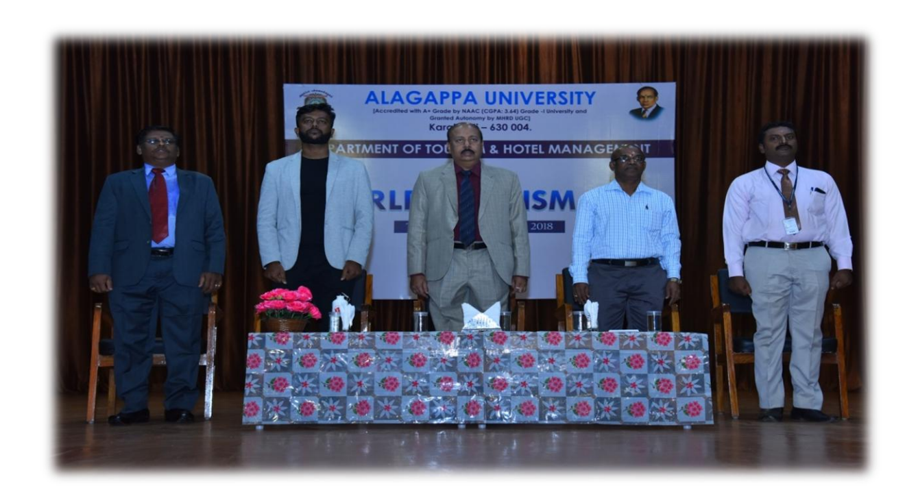
Dignitaries are on the dias