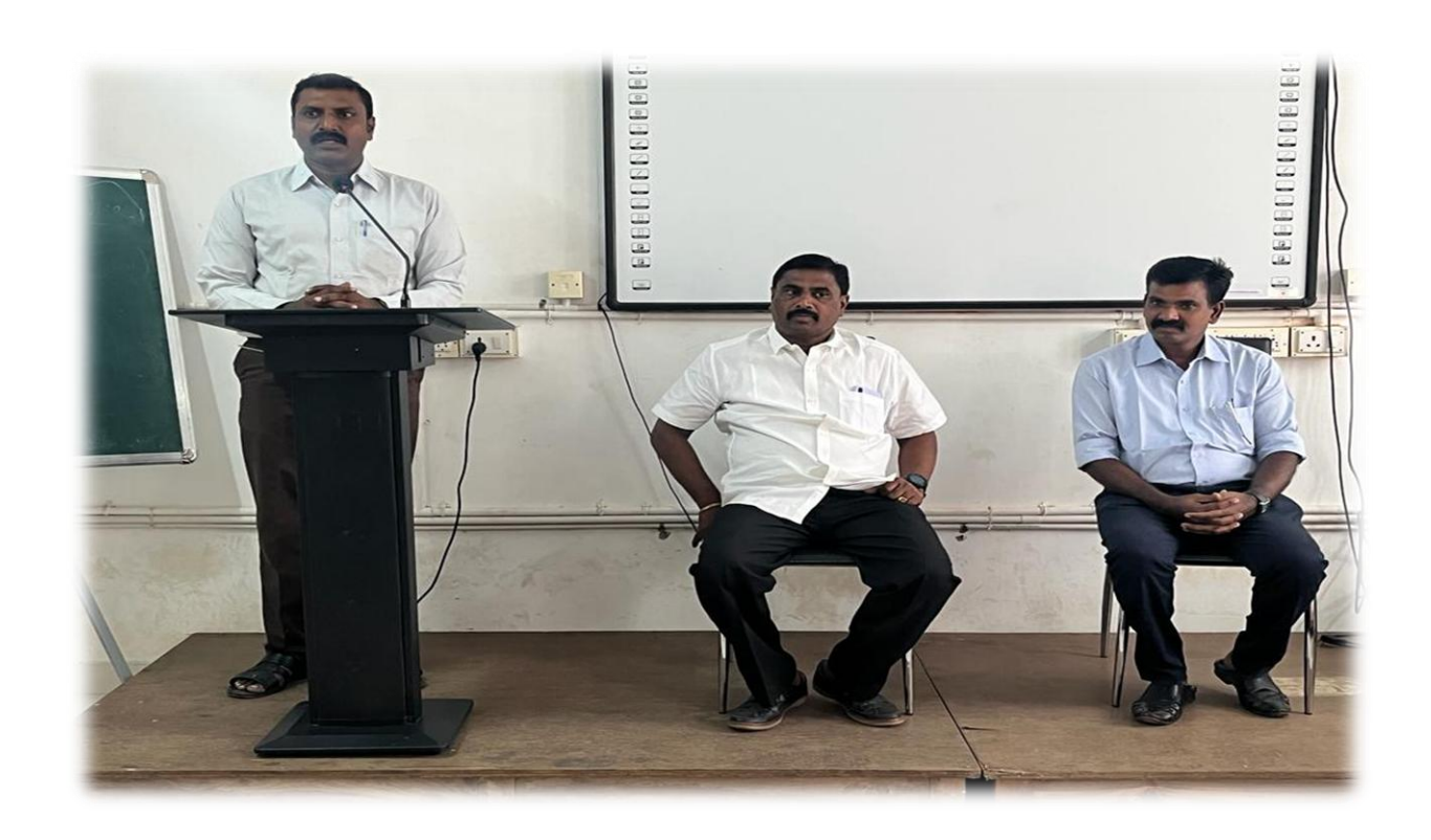
Our staff member is welcoming the another chief guest who handled the second session