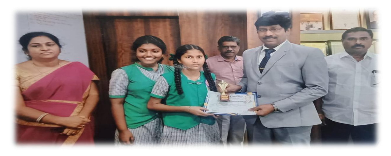
Honourable Vice chancellor is distributing certificates to the winners