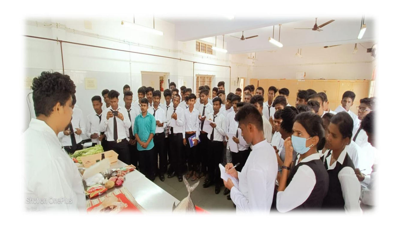
The resource person is demonstrating to the students