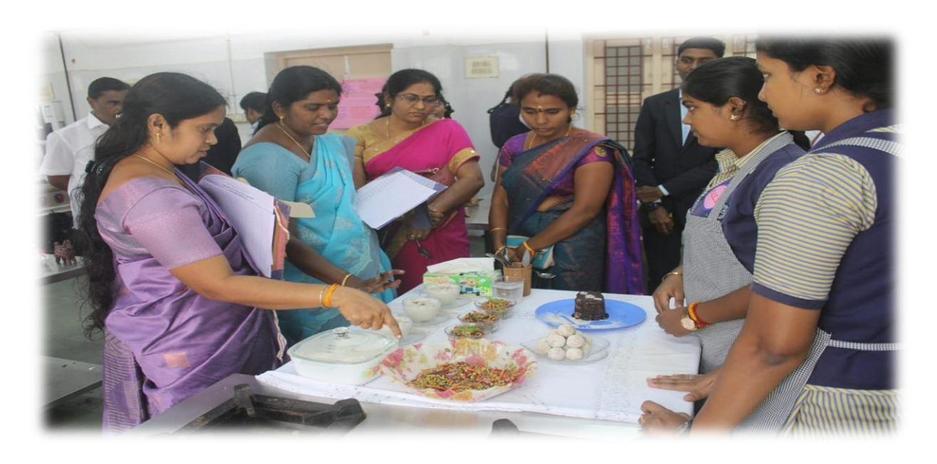
Experts are evaluating the students prepared foods